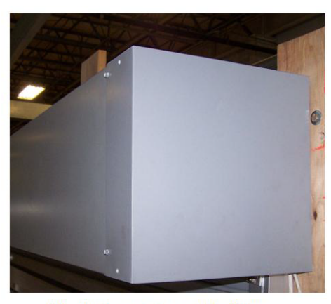
Mechanism Cover - Side View