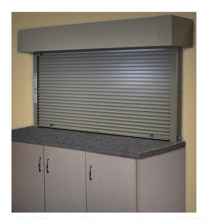
Field Mounted Operator, Face of Wall Counter Shutter